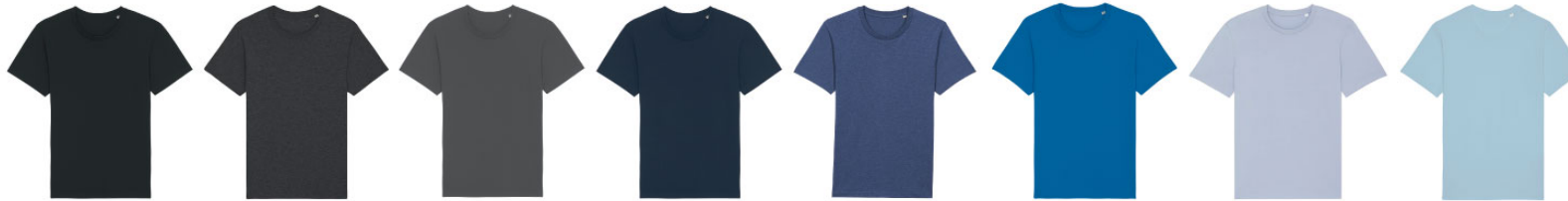
Black Dark Heather Grey Anthracite French Navy Dark Heather Indigo Royal Blue Serene Blue Sky Blue