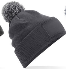
Graphite Grey/ Light Grey