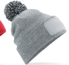
Heather Grey/ Black