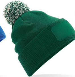
Bottle Green/ Off-White