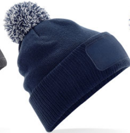
French Navy/ Light Grey