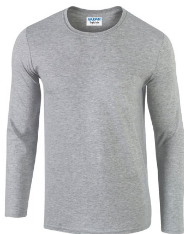
Heather Sport Grey