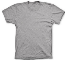
RS Sport Grey*