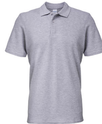
Heather Sport Grey