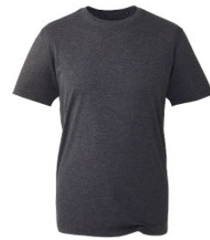
Dark Grey Marl