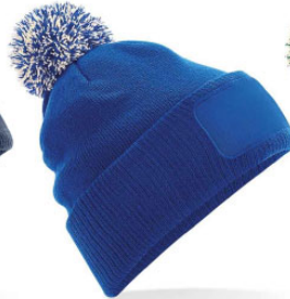
Bright Royal/ Off-White