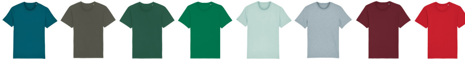
Ocean Depth Khaki Bottle Green Varsity Green Caribbean Blue Heather Ice Blue Burgundy Red