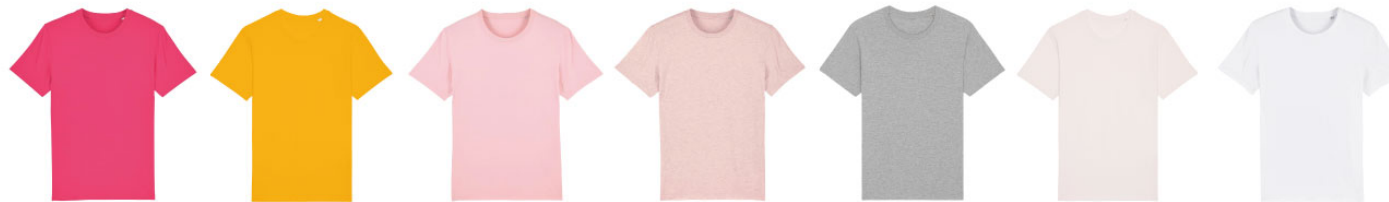
Punch Pink Spectra Yellow Cotton Pink Heather Pink Heather Grey Vintage White White