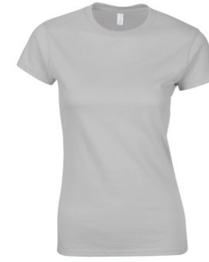
Heather Sport Grey