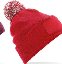
Classic Red/ Off-White